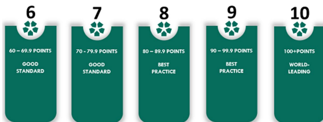
Figure 1: The Homestar points system

The Homestar rating tool is assessed on a scale of 1-100+. For a house to be a certified Homestar, it must achieve 60 or more points in the rating. There are five different levels of Homestar certification (see Figure. 1) ranging from 6 Homestar to 10 Homestar. A 6 Homestar house is easy to keep warm and healthy, more environmentally friendly than the building code, and is more cost effective to run, and a 10 Homestar house indicates a world leading home.